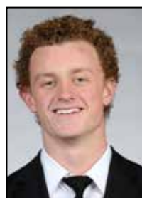
Jack Eichel, BU - 2015