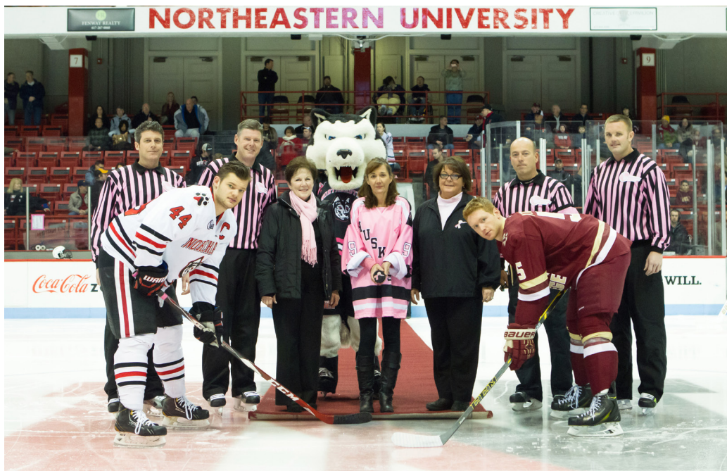
The 2014-15 incarnation of Skating Strides saw record participation by each men's and women's program and helped to raise over $33,000 for breast cancer research.