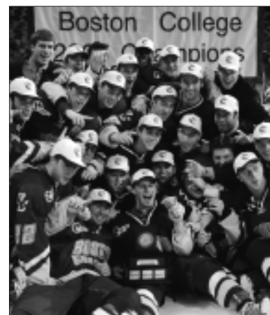
Boston College won the Lamoriello Trophy in 2007 in 23rd annual Hockey East Championship. The Eagles won their league leading seventh tournament title in school history.