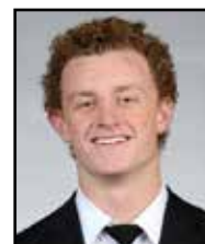
MVP: Jack Eichel, BU